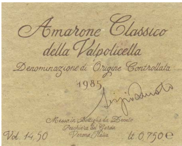
SERGIO ZENATO 1985